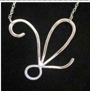
Custom initials necklace

Canopy cut sterling silver ring with cubic zirconia settings