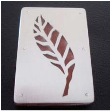
Custom leaf brooch / pendant