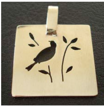
Gold little birdie